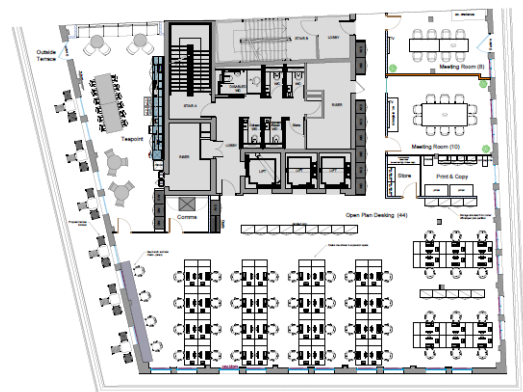
8 th Floor – Current Layout